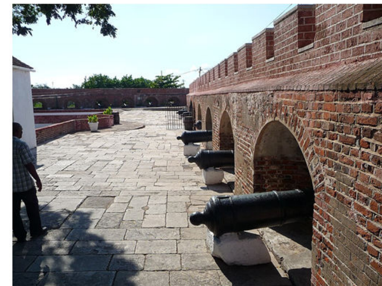
17 th Century cannons at Port Royal (the part that is on land)