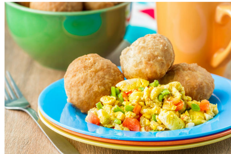
Ackee and saltfish