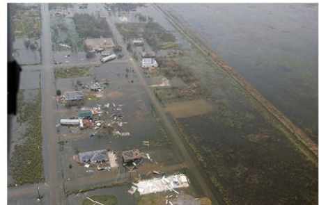
Galveston Bay, Texas after Hurricane Rita (2005) Rita is one of the retired hurricane names.

Recently-retired hurricane names include Fiona (2022), Ian (2022), Ida (2021), and Laura (2020).