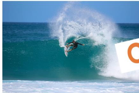
surf in Hawaii