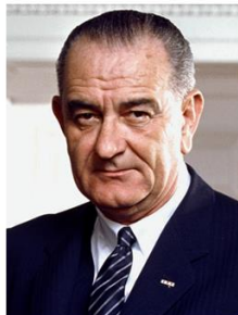
Lyndon B. Johnson