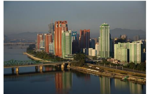
Pyongyang apartment buildings along the Taedong River.

Censorship and harsh laws are a way of life in North Korea.