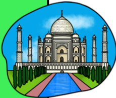
Taj Mahal (India)