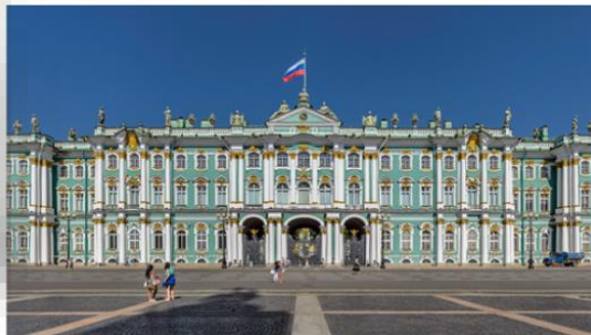
The Winter Palace in St. Petersburg, Russia

Borscht is a popular food in Russia. What is it?