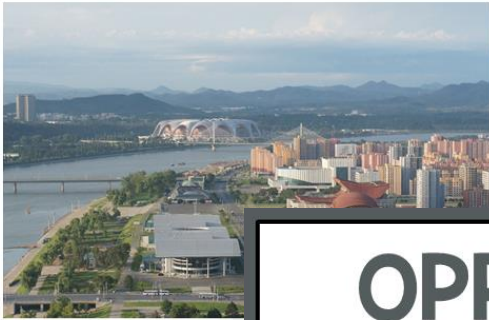
Pyongyang is the capital of North Korea. (note the enormous size of the city)

North Korea is very different from South Korea. The country is mostly cut-off from the rest of the world, even in times of great need and famine.