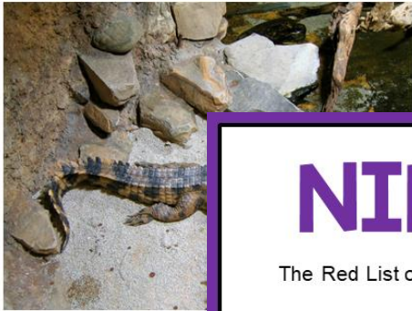
The slender-snouted endangered species. T

The IUCN's Red List of Threatened Species only includes animal species.