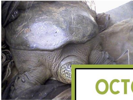
Yangtze giant s

There is currently only one Yangtze giant softshell turtle left in captivity.