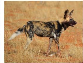
African wild dog