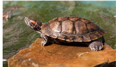
Red-eared slider turtles are classified as least concern .

Digital Bulletin Boards are a passive program that teaches new information in a fun, interesting way.