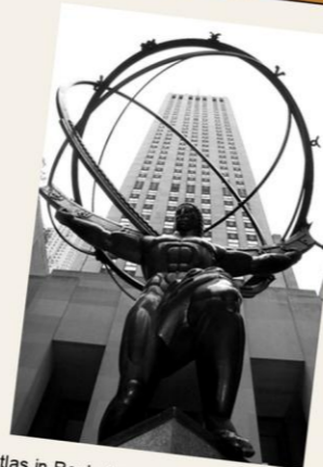
Statue of Atlas in Rockefeller Center in New York City.

Atlas has a daughter named Maia. Maia is the mother to Messenger God Hermes. That makes Atlas the grandfather to Hermes.